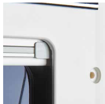
STYLISH INNER FRAME Suits the interior of most RVs