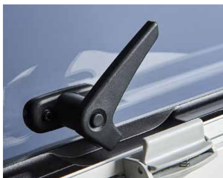
EASY TO OPEN AND CLOSE Simple opening with built-in clips