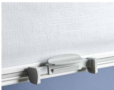
BLACKOUT BLIND Control the amount of light in the RV