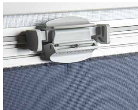
BUILT-IN FLY SCREEN Keeps unwanted insects out