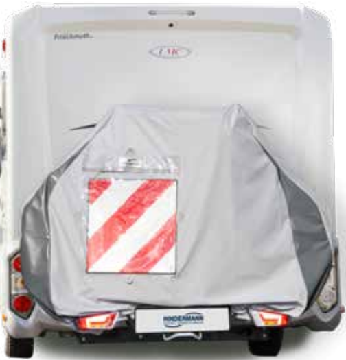
Use on rear stage on a hitch rack on motor homes. (Art. No. 8472-2460)