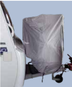
Tailor-made for the particular shape of ready-to-ride wheels.